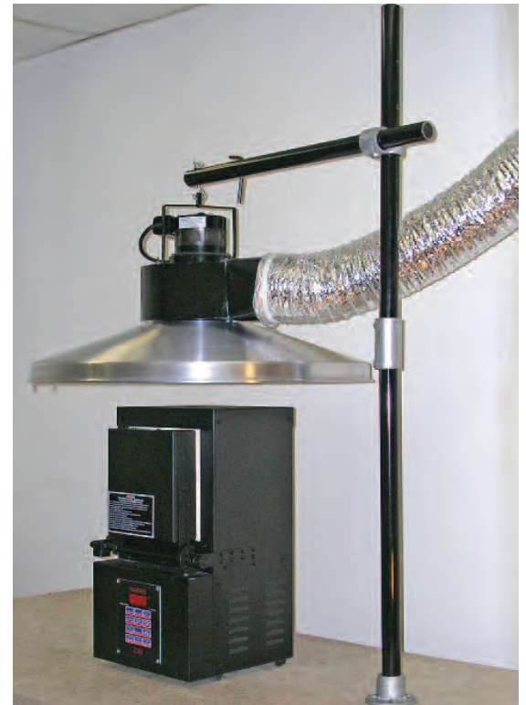
Vent-A-Fume's table-mounted ventilation system installed over a dental burnout oven.

Ideal for the professional or hobbyist, table-mounted ventilation systems are easy to install and feature a close-capture design for quick and efficient removal of virtually all process emissions and an adjustable height positive-pressure system exhausts excess heat and fumes to the outside or into existing ductwork.